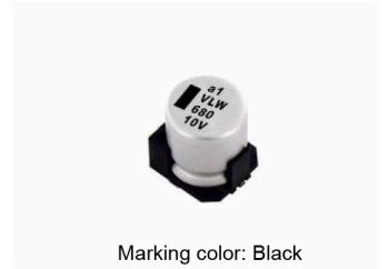
Marking color: Black